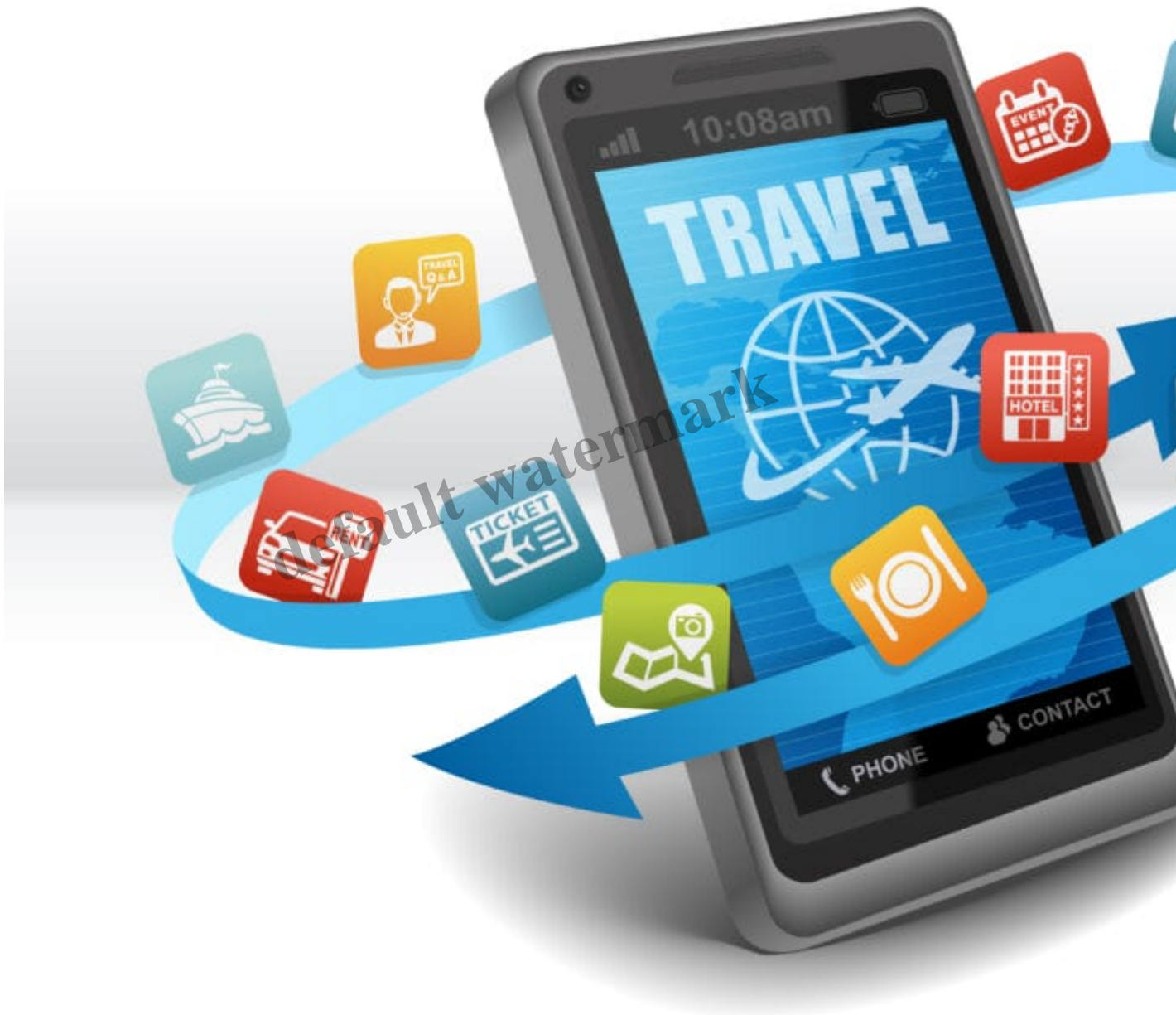
Best Travel Apps