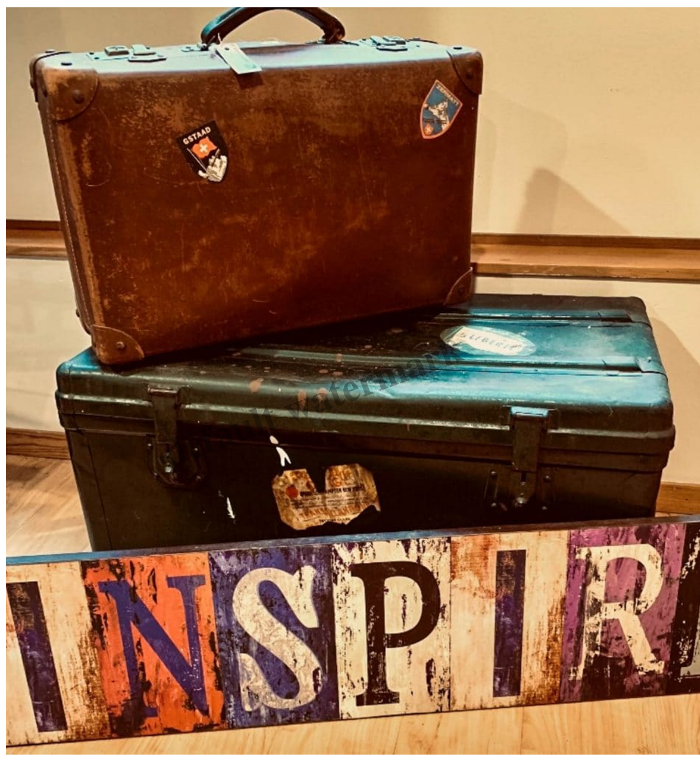
Best travel resources and services