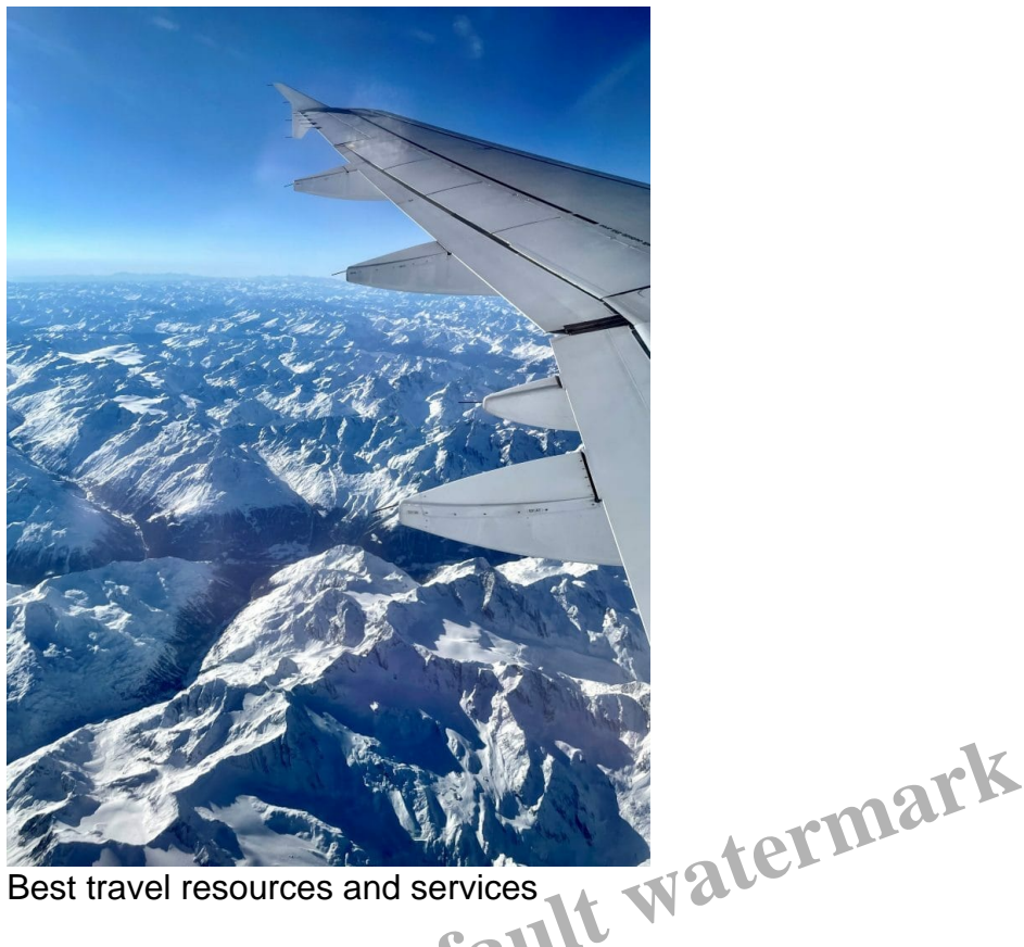
Best travel resources and services

There are many sites out there to shop for all elements of travel, including travel gear and clothing. It can become overwhelming for many with so many options. Though we are very budget-conscious, we are not the kind of travelers who will fly in a middle seat, sleep in a sketchy hotel, stay in hostels, or are willing to stand in long lines to save a few dollars. The vendors we use must have great ratings, advocate for their customers at times, and provide a quality product they stand by. We are not expecting perfection but a voice when things go sideways. That is why we are big believers in brand loyalty and wrote an article about it. Check it out here.