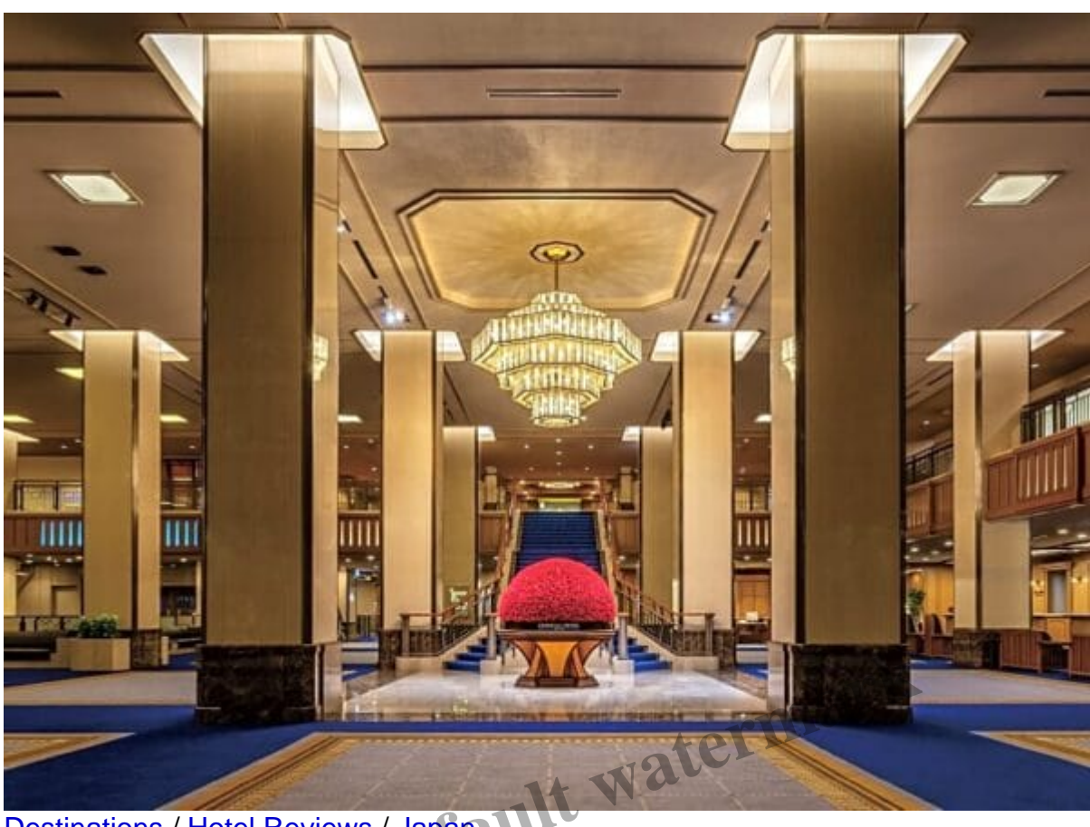
Destinations / Hotel Reviews / Japan