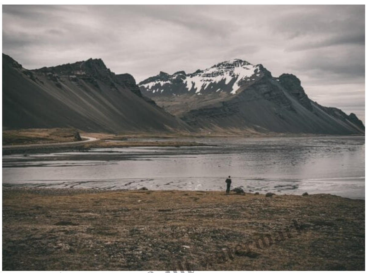
Destinations / Iceland