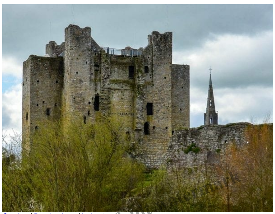
Castles / Destinations / Ireland