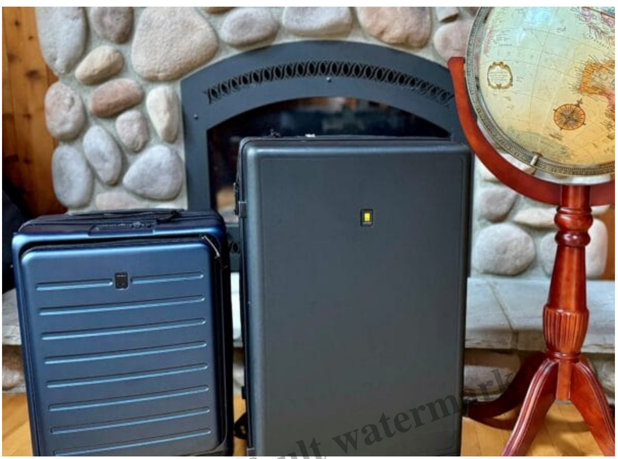
Travel Tips & Resources