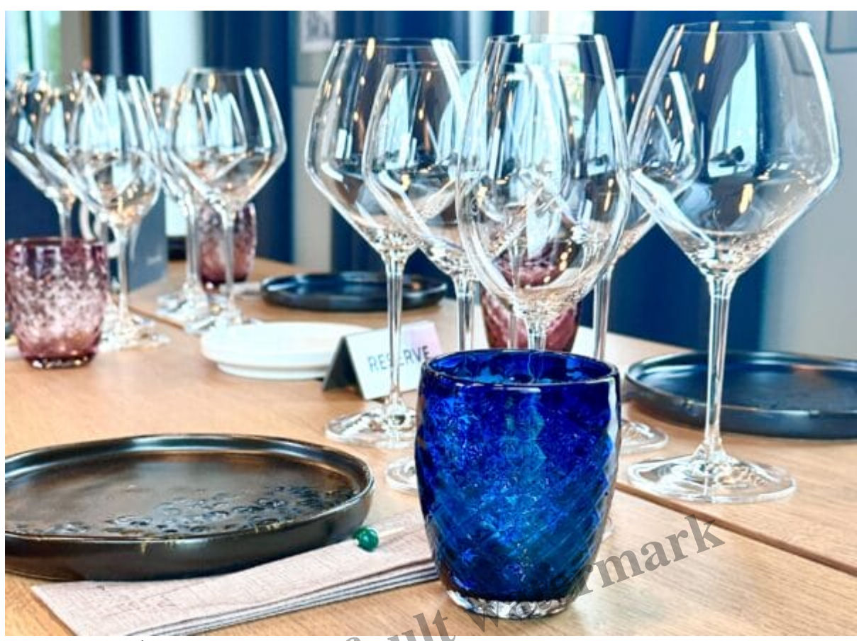
Destinations / Pubs Breweries Wineries & Bars