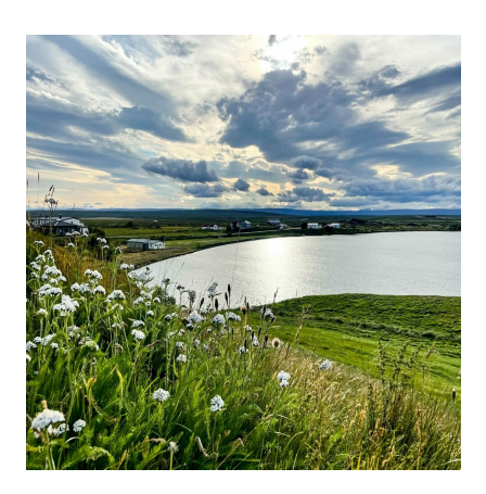
Wanderers Compass Videos