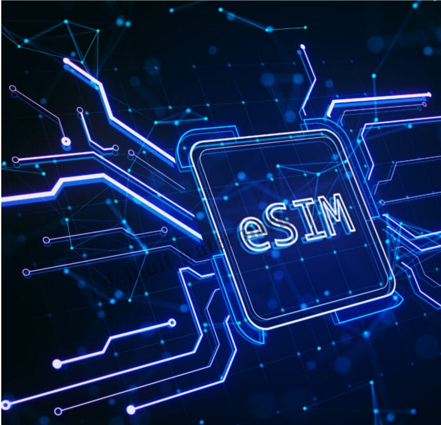
A glowing eSIM concept on a digital circuit background, highlighting technology and communication. 3D Rendering

This article contains affiliate links. If you use these links to buy something, we may earn a small commission at no additional cost to you. Thank you!