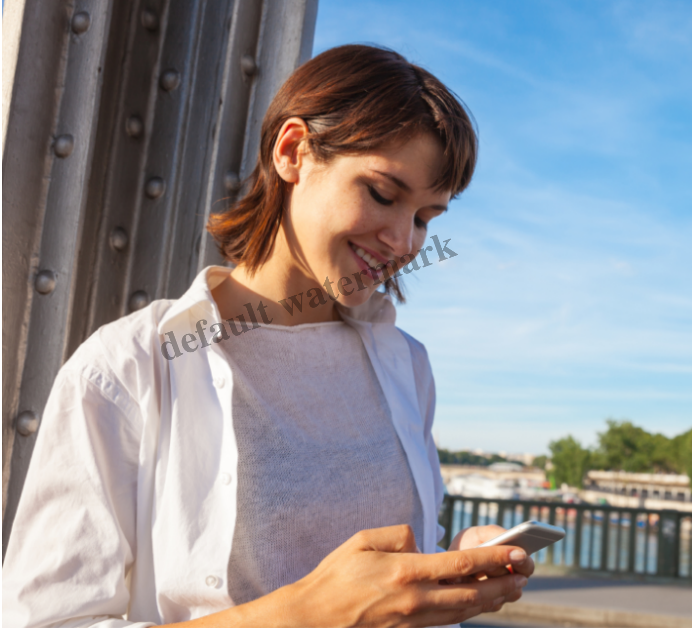
Phone connectivity in France GigSky eSim

GigSky actively seeks feedback from its users so it can improve its services. The company seems to value customer input and then uses it to enhance the overall user experience. It is a very competitive market out there; staying on top of the game is how you stay on top of the game. To remain at the forefront, the company is exploring new partnerships, technologies, and markets. With the rapid growth of eSIM use and the increasing demand for reliable global connectivity, GigSky is well-positioned to continue its success.