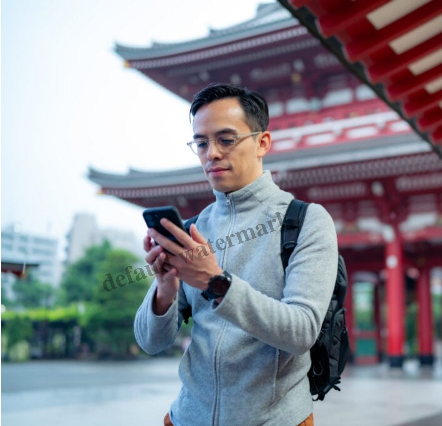
GigSky eSIM

Traveling abroad can be thrilling, but staying connected has become a frequent hassle. GigSky will ensure you have seamless internet access no matter where you roam. Here's how they do that: