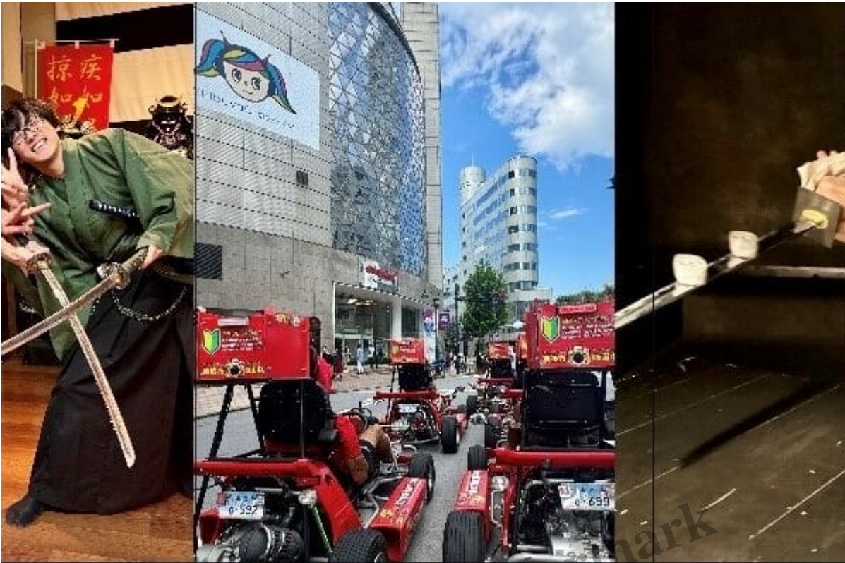
Destinations / Japan