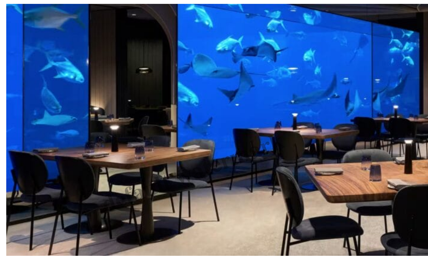
Image from Ocean Restaurant website: Top 6 restaurants in Singapore

Dine amid the world's largest oceanarium at Ocean Restaurant, with a floor-to-ceiling glass panel offering magnificent views of the ocean's mysteries. Catch a glimpse of sharks and groupers as you enjoy your meals crafted by Chef Olivier Bellin at S.E.A. Aquarium on Sentosa Island. The restaurant is known for its refined modern European menu, which includes a variety of seafood, meats, and vegetarian choices.