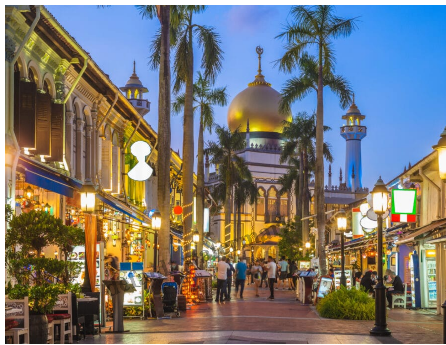
Street view of Singapore. Top 6 restaurants in Singapore

As part of our guest writers series, we are excited to welcome Mohammed Mudhasser, a passionate traveler and freelance writer.