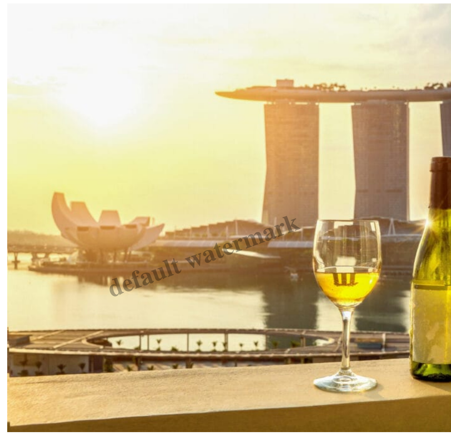
Top 6 restaurants in Singapore

Where to go on your next overseas adventures? Check out our Country Travel Guides