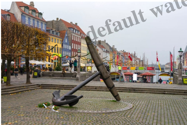
Memorial Anchor

4. Stop by the Memorial Anchor in Kongens Nytorv at the end of Nyhavn. This memorial commemorates the 1,700 Danish Navy officers and sailors who were killed in WW II. The Anchor has been there since 1951 and is an excellent place to pay tribute to anyone who has served their country.