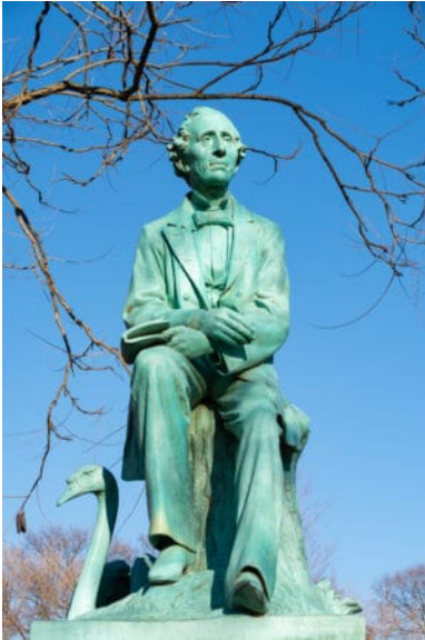
Hans Christian Andersen Statue