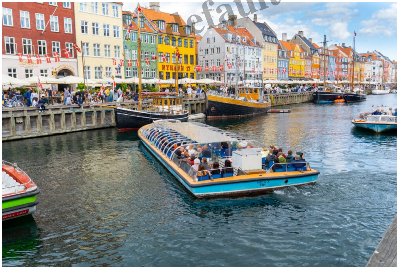
Grand Canal Tour