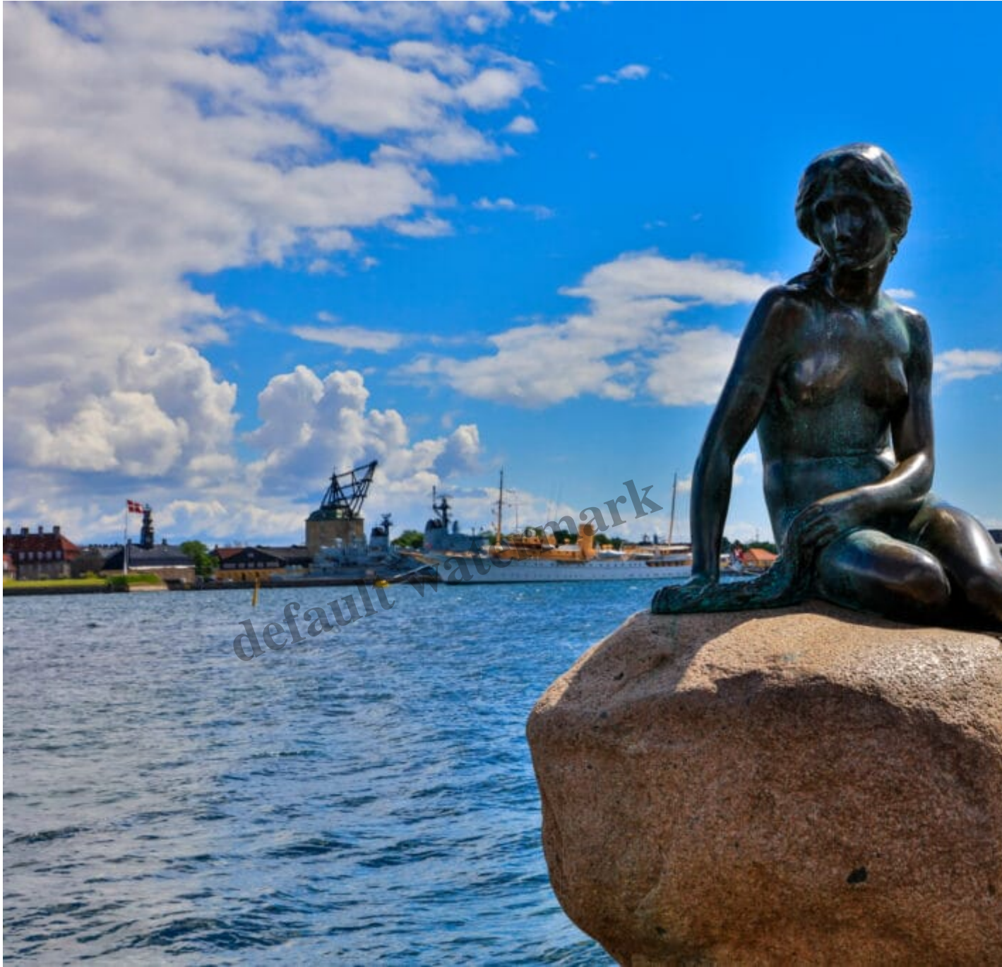
Little Mermaid sculpture

Since we are in Nyhavn, the home of Hans Christian Andersen , it only makes sense to head to the Little Mermaid Statue. This statue, built after the author's death, depicts a woman sitting on a rock and longingly looking out to sea. It is one of the most popular tourist sites, and people always surround it, but still well worth a visit. It is along the water and a 23-minute walk from Nyhavn.