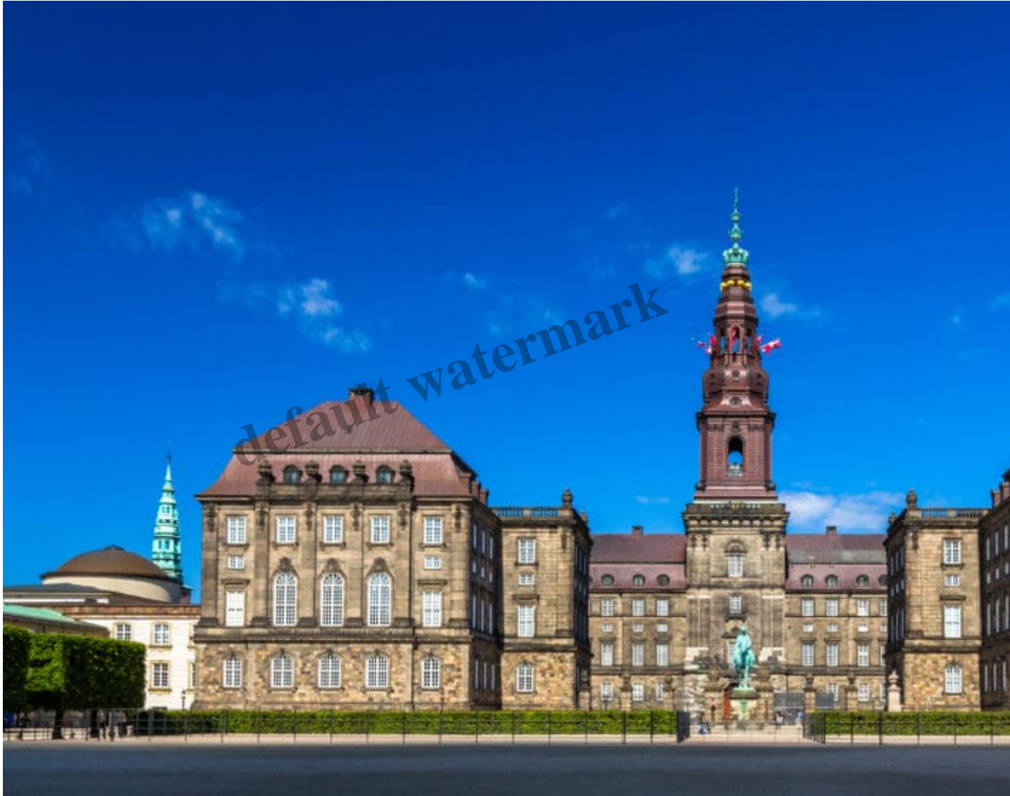
Christiansborg Palace in Copenhagen, Denmark

In the central part of Copenhagen, you will find Christiansborg Palace. Once the principal residence of Danish monarchs, Christiansborg Palace is now the heart of Denmark's governmental home to the country's parliament and supreme court. Christiansborg is one of Copenhagen's most iconic landmarks, holding over 800 years of Danish history. There is plenty to see at the Palace, including The Royal Reception Rooms with The Great Hall and The Tapestries, The Royal Stables, The Royal Kitchen, Christiansborg Palace Chapel, and The Ruins under Christianborg Palace. It is a popular destination, so buying tickets in advance is ideal. Visit our Viator link to see what great tours they offer at the Palace and around the city.