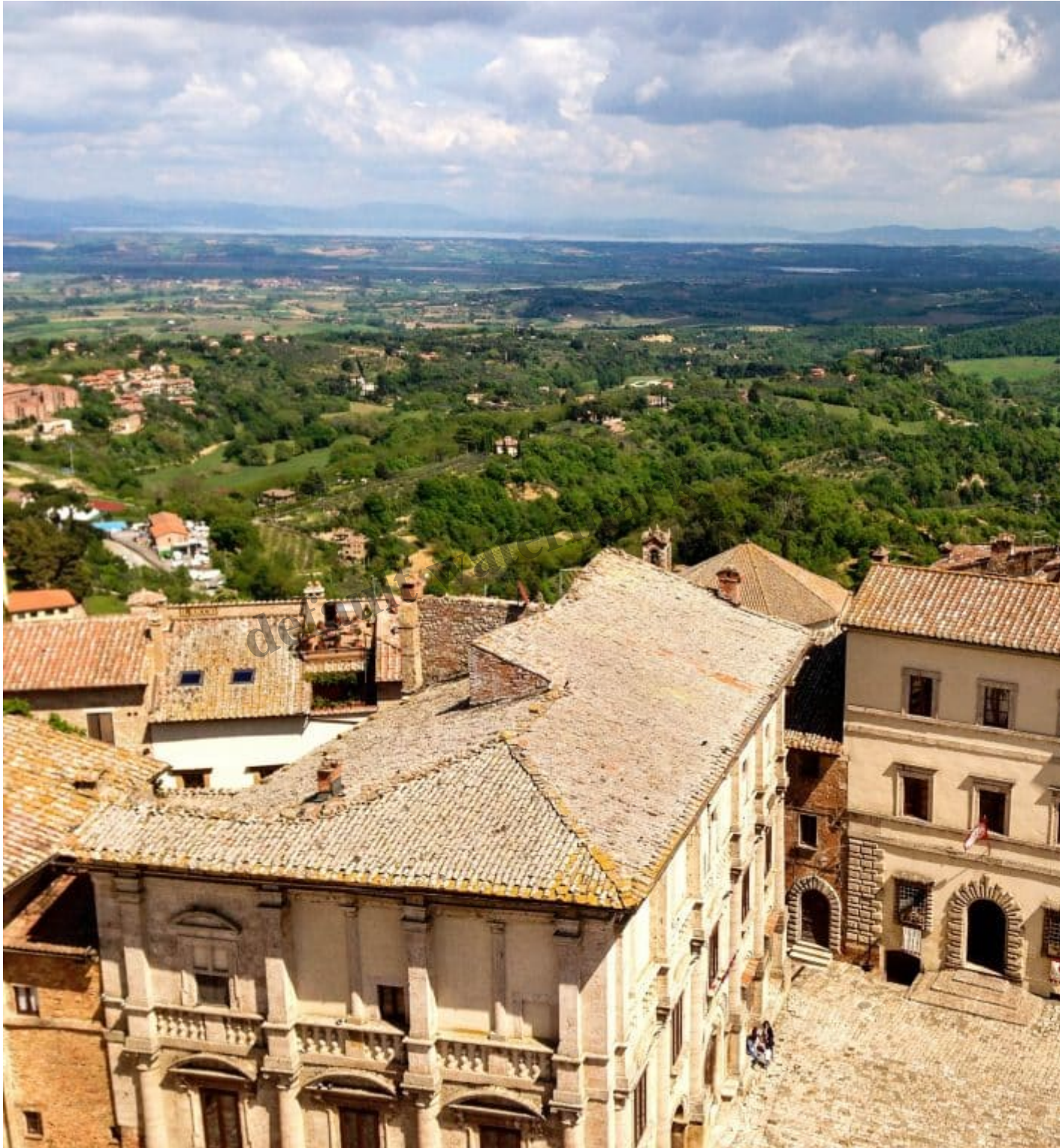
Town of Montepulciano, Italy

Recent findings indicate that Montepulciano was settled here between the 3rd and 4th centuries BC. Many Etruscan and Roman finds have been made in this district, confirming its great antiquity. King Liutprando first recognized the name Montepulciano