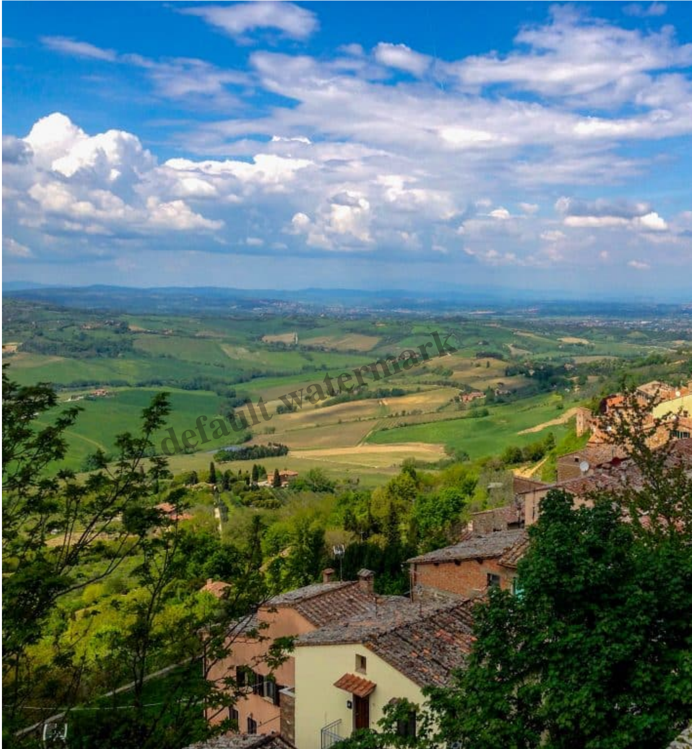
View from Montepulciano, Italy, upper town

Montepulciano is on a minor rail line, and the small train station is a few miles outside town. Buses connect the train station with the town. Hourly buses run from Chiusi train station, on the major rail line between Rome and Florence and probably more