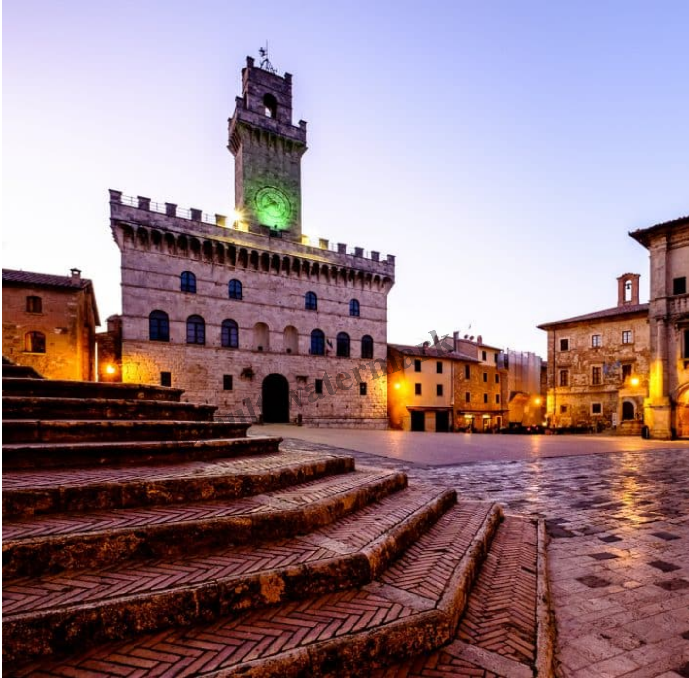
Piazza Grande in the Old Town of Montepulciano

The beautiful Renaissance hill town of Montepulciano is known for its red wine. It is considered one of the finest winemaking regions in the world. However, red wines shouldn't be the only reason to visit this gem. This Tuscany wonder offers magnificent views, medieval history, and many attractions to keep visitors of all ages entertained. Now, you can visit Montepulciano, Italy, and explore it as a local.