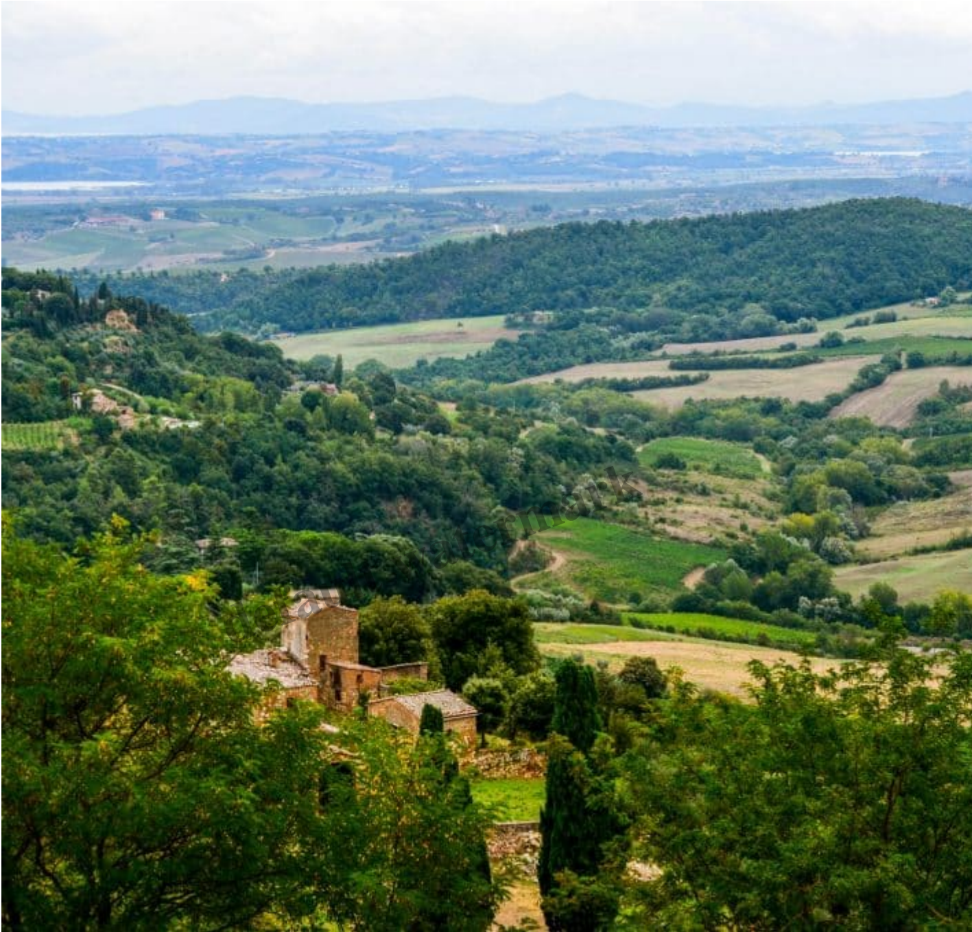
Montepulciano Italy views

Montepulciano is located on top of a hill, surrounded by many vineyards, rolling green hills, golden fields, and a fortress. No matter what alley you turn into, you will come to a terrace with expansive views of iconic Tuscany. Its beautiful hilltop presence adds so much to this medieval fairytale. In addition, the elegant Palace, visually enticing markets, and lovely historical buildings give it a majestic, reticent atmosphere.