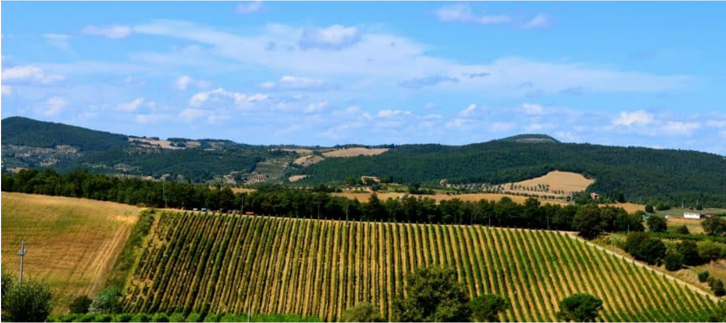
Montepulciano, Italy Vineyards

The best time to visit Montepulciano, Italy, is typically during the spring (April to June) and fall (September to October). Here's why: