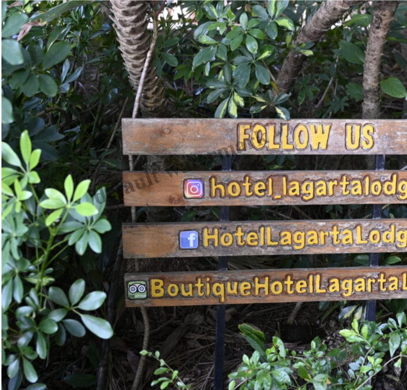
Photo Gallery of the Hotel Boutique Lagarta Lodge