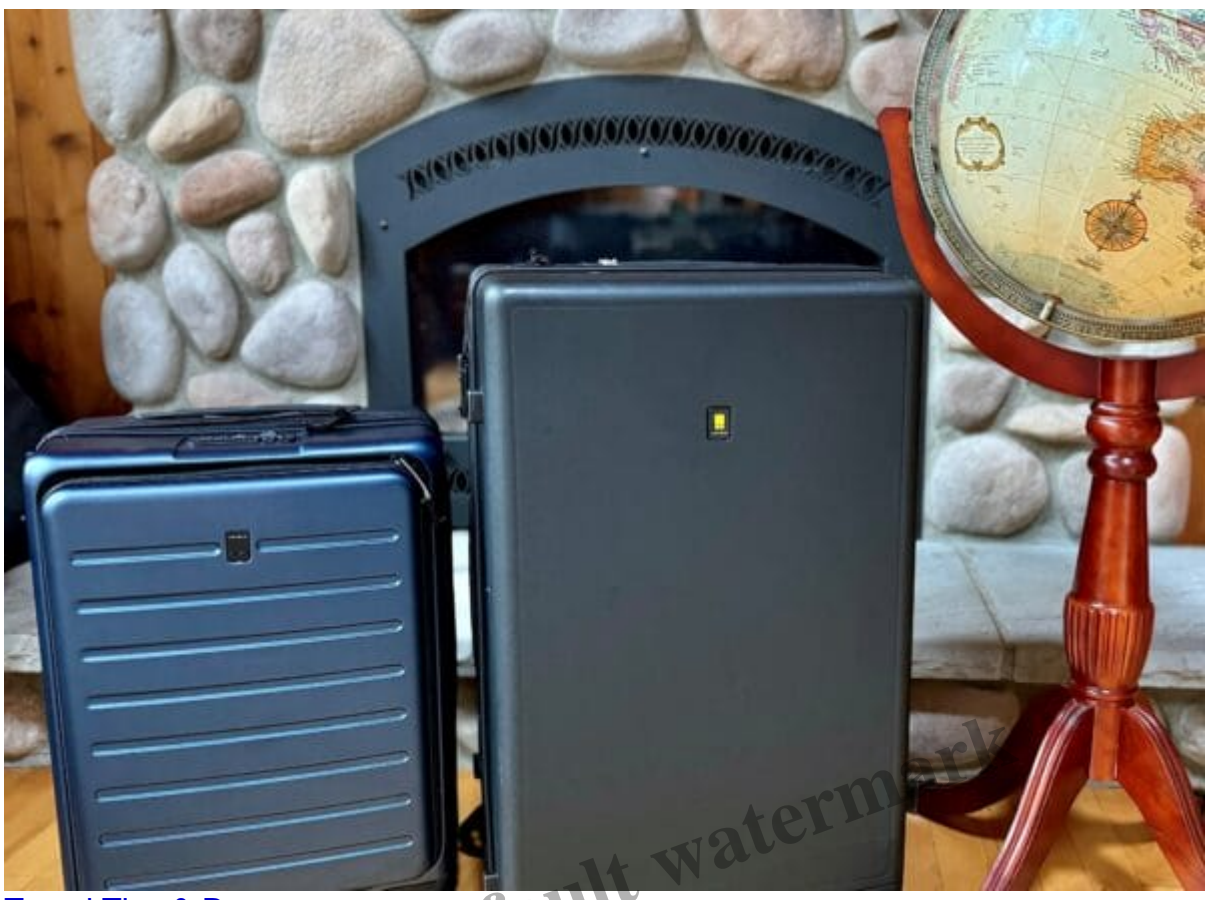
Travel Tips & Resources