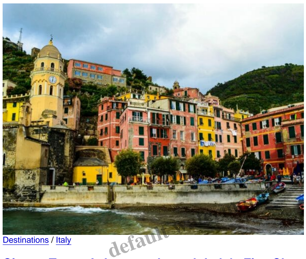
Destinations / Italy