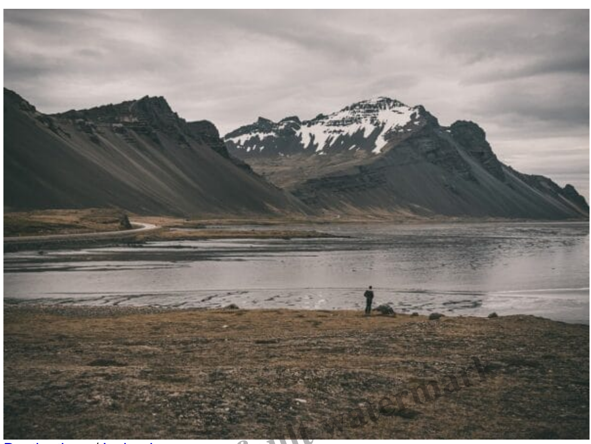
Destinations / Iceland