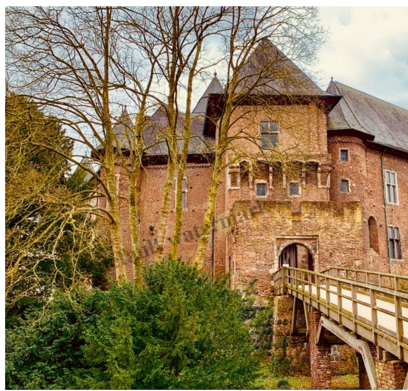
Burg Linn Castle, Germany

"A mind that is stretched by a new experience can ever go back to its old dimensions."