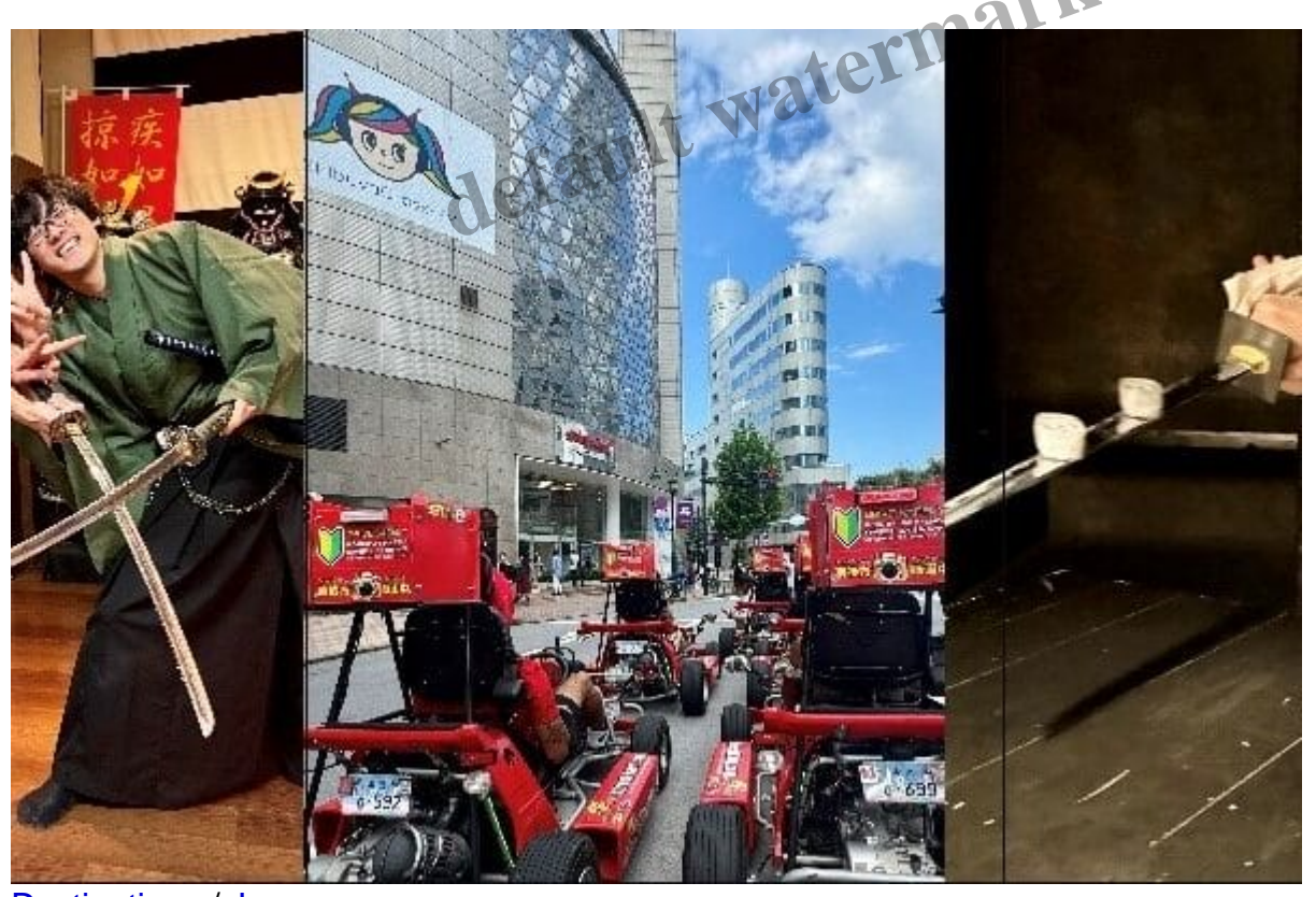
Destinations / Japan