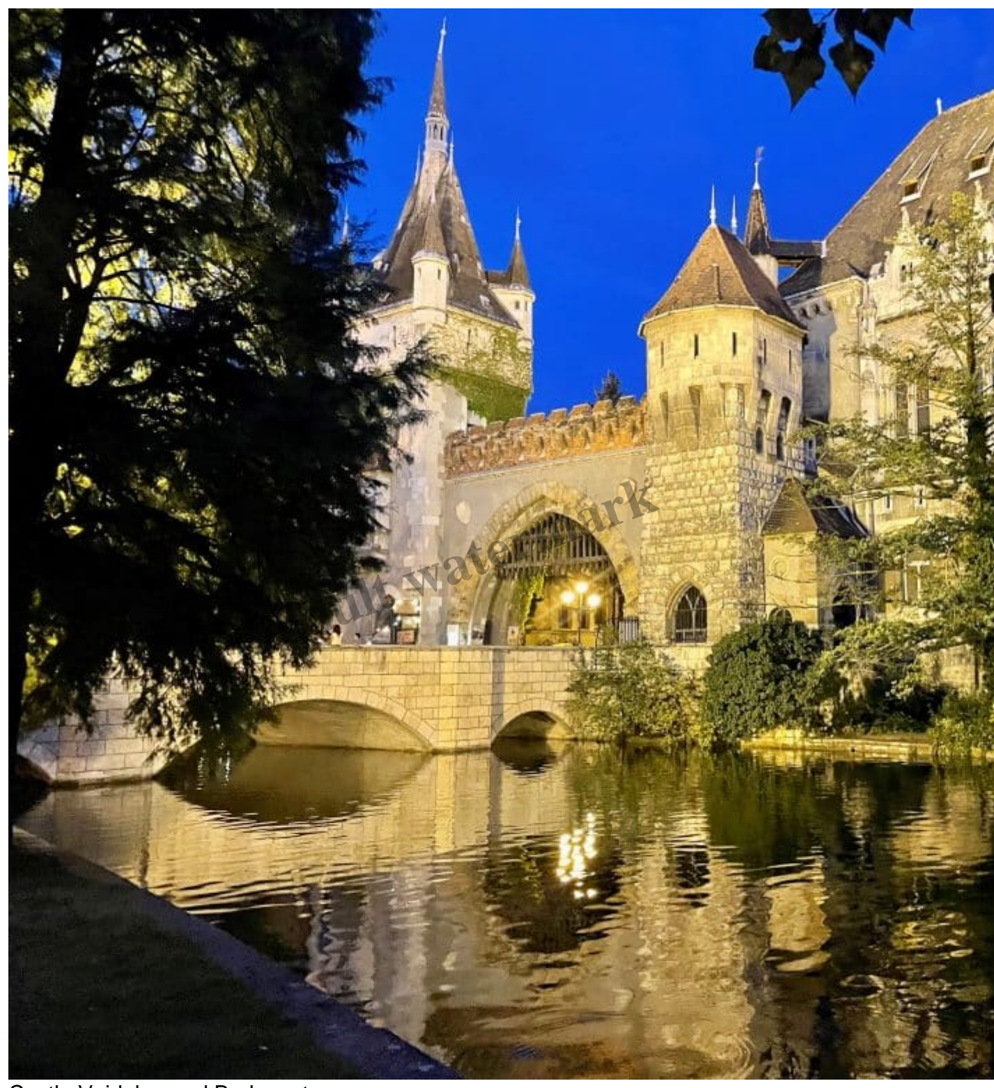
Castle Vajdahunyad Budapest