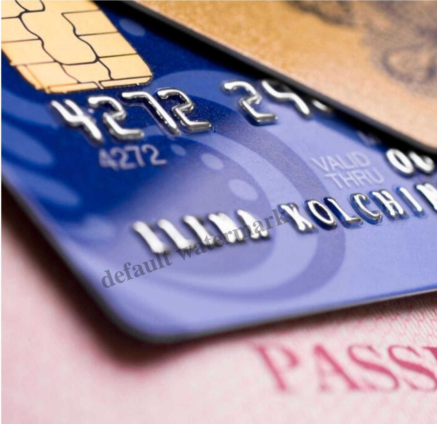
Best Credit Cards for Travel in 2024