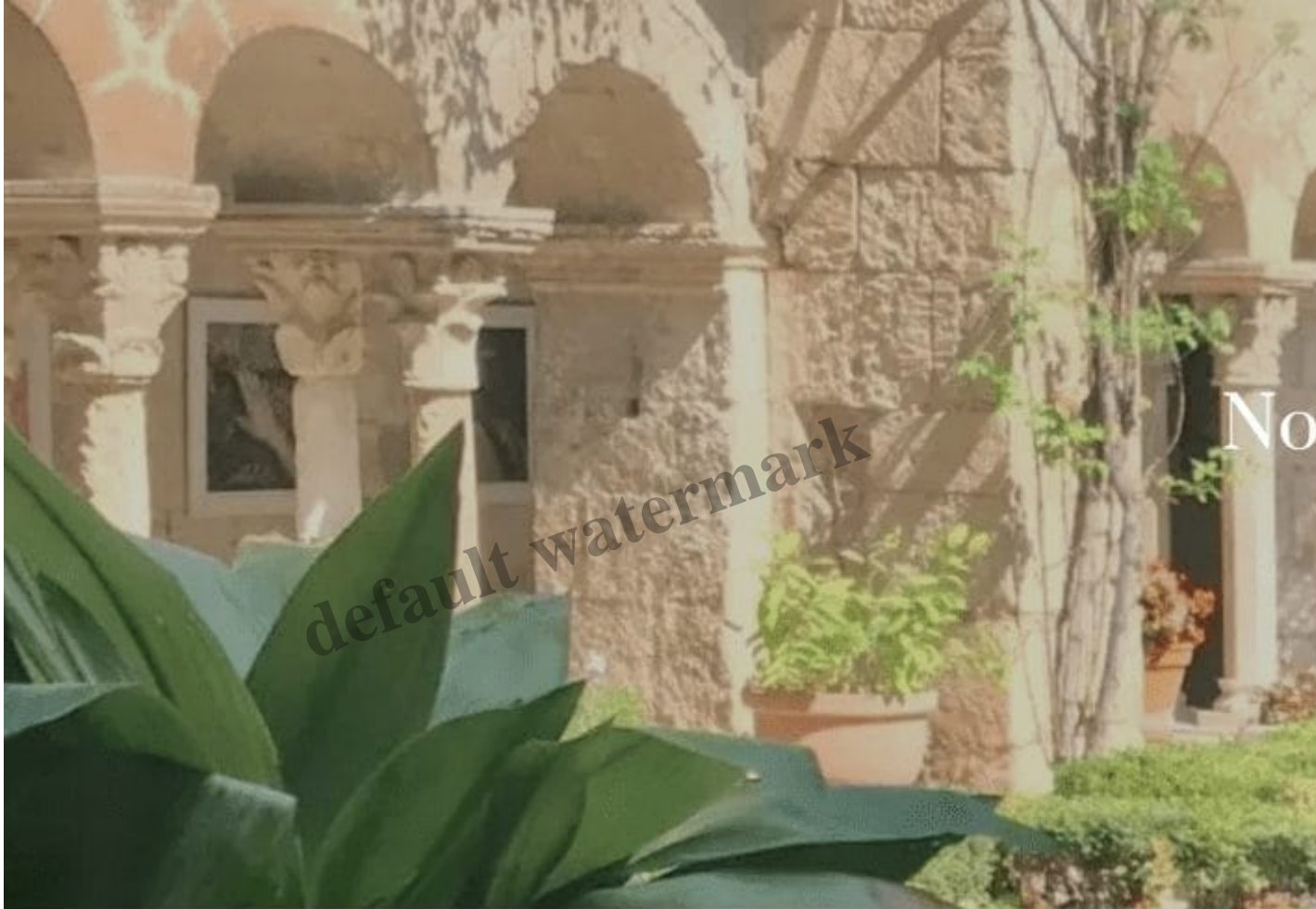
Best Credit Cards for Travel in 2024

To guide you to the correct card, we have compiled the best credit cards for travel in 2024. That said, every card on this will not fit everyone. That is because it depends on your travel style and goals. We prefer to spend reward points on hotels and flights, which is why we like the Chase Sapphire Reserve Card. We also have our travel brand travel cards (such as Hilton & United) for free companion fares, free checked luggage, room upgrades, ease of checking, elite status, and special offers.