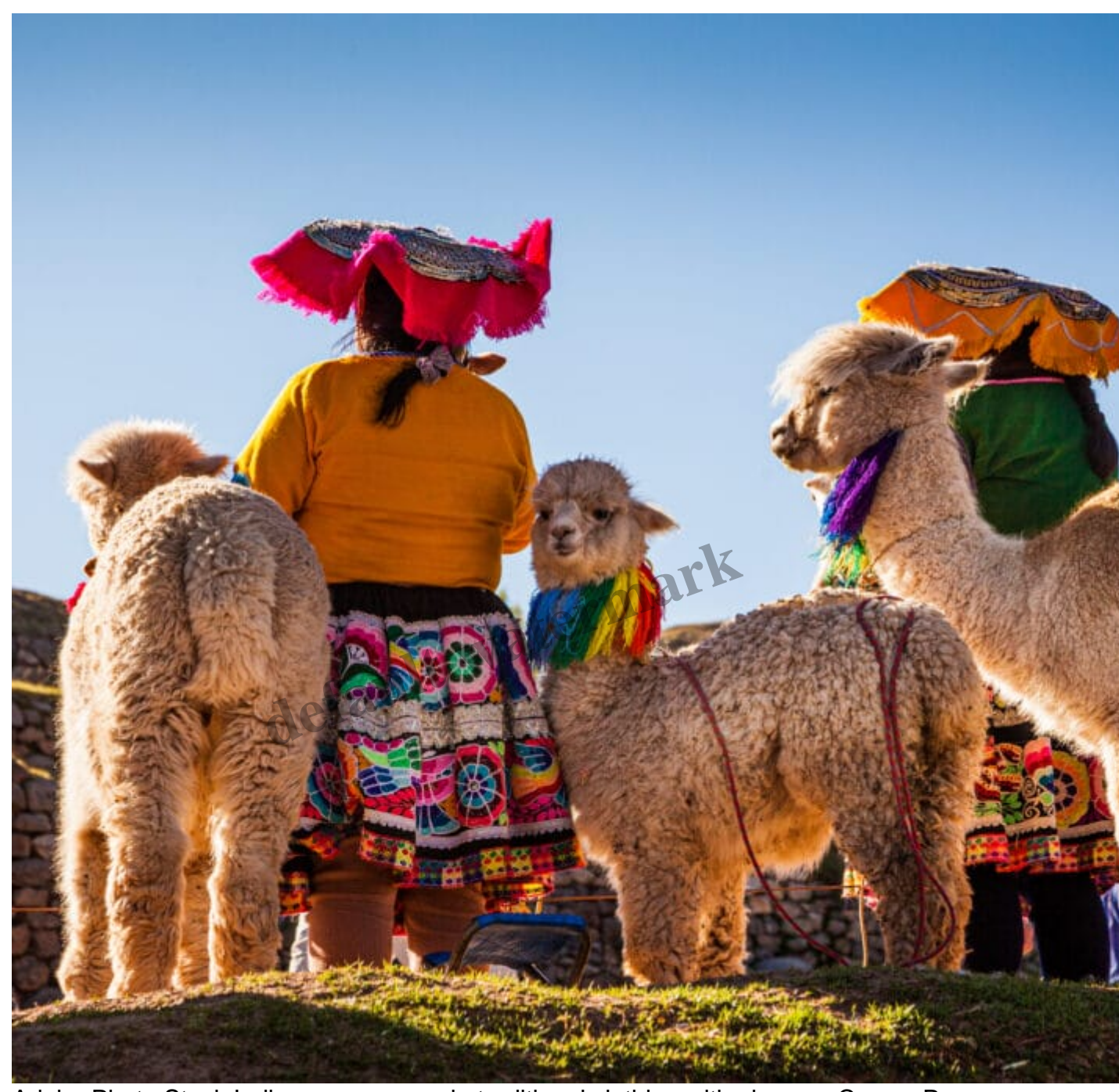
Indigenous women in traditional clothing with alpacas, Cusco, Peru

Check out Peru's official tourism website.