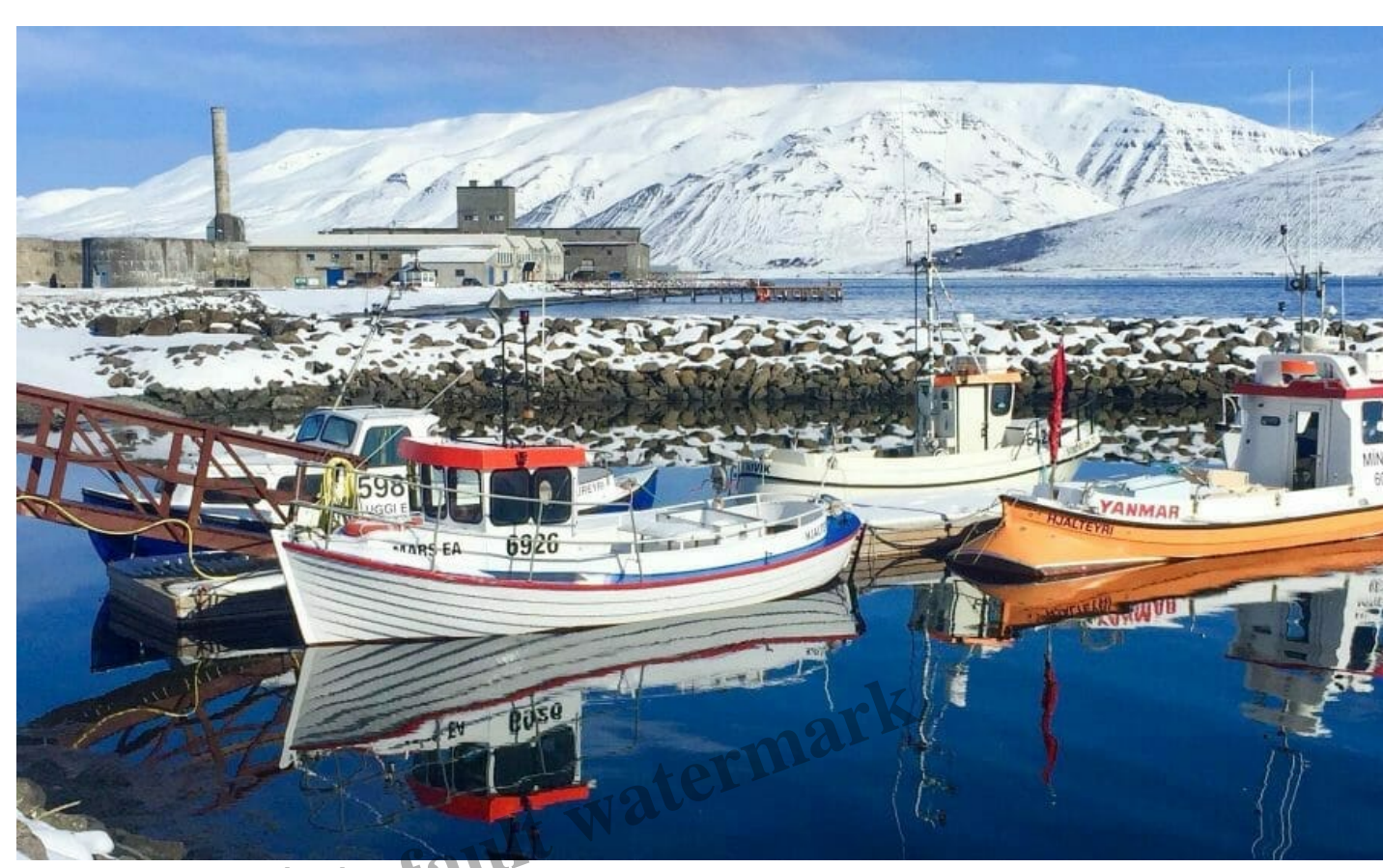
Iceland Top 5 Destinations

Check out Iceland's official tourism website.