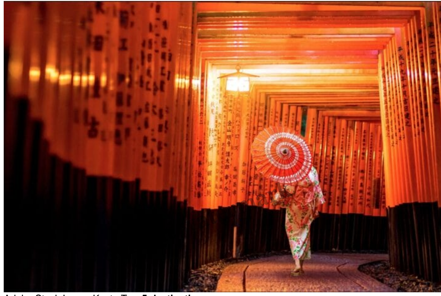
Kyota Top 5 destinations

Embarking on a <u>4-day Japan tour</u> that includes a visit to Kyoto offers travelers a profound cultural immersion into Japan's rich heritage and traditions. Kyoto, renowned as Japan's cultural capital, captivates visitors with its serene temples, historic tea houses, and meticulously landscaped gardens. The tour typically begins with exploring Kyoto's UNESCO World Heritage sites, such as the iconic Kinkaku-ji (Golden Pavilion) and the peaceful Fushimi Inari Shrine with its famous vermilion torii gates.