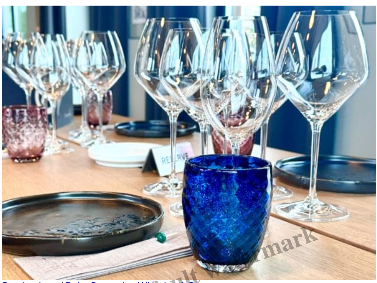
Destinations / Pubs Breweries Wineries & Bars