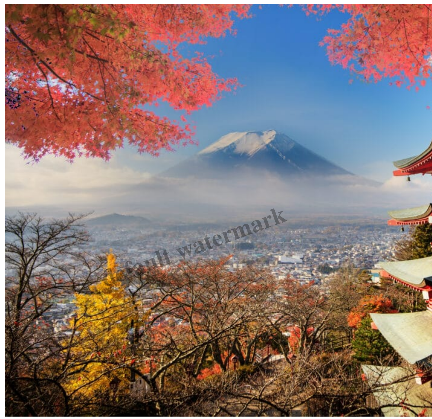
Mt. Fuji with fall colors in Japan.

Check out the official tourism website of Japan