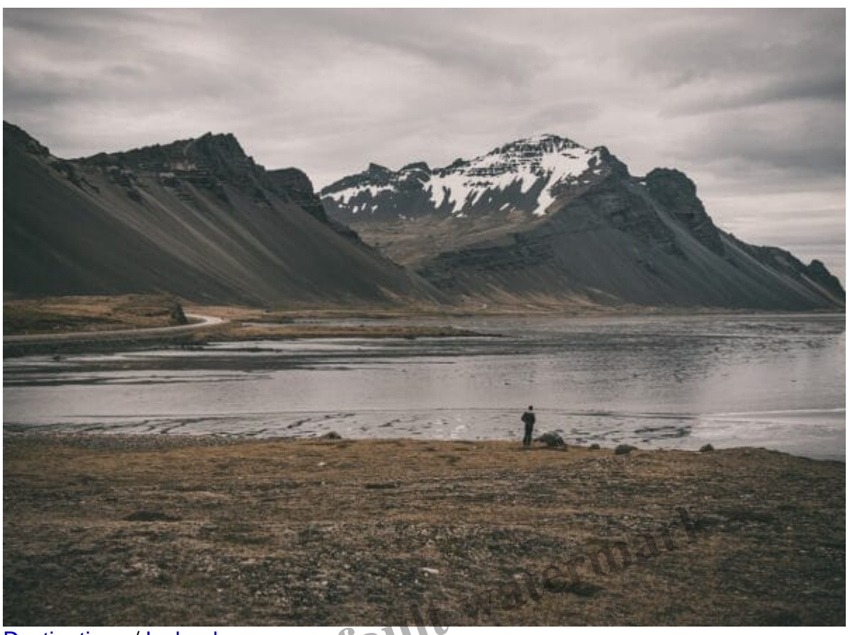
Destinations / Iceland