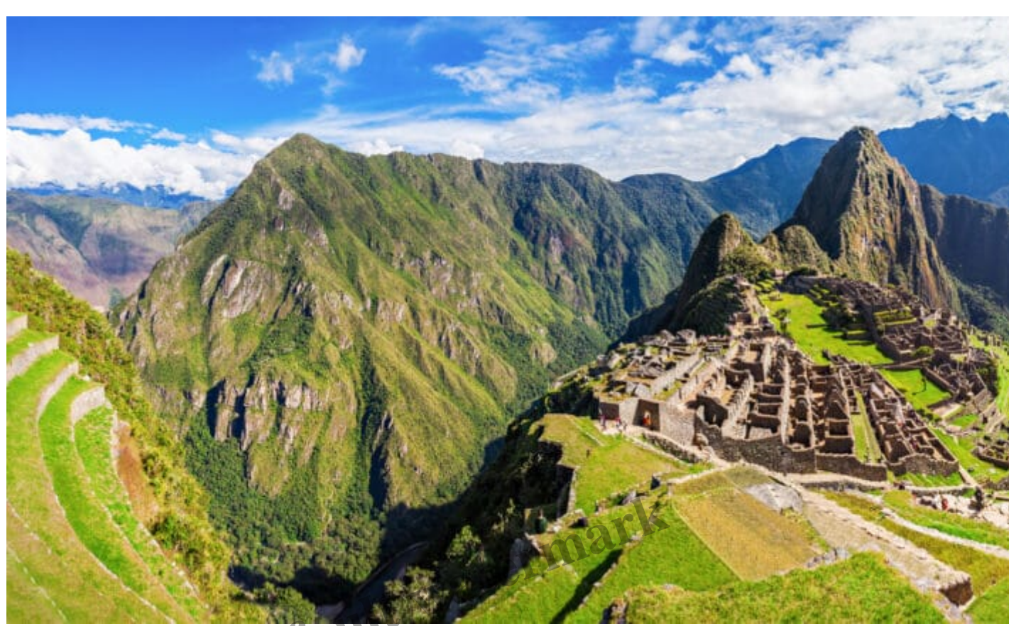
Adobe Stock Image Machu Picchu Top 5 destinations

Exploring Machu Picchu, Peru, is an awe-inspiring journey into the heart of Inca civilization. Nestled high in the Andes Mountains, this ancient citadel, often shrouded in mist, offers breathtaking views of lush green peaks and terraced landscapes. Believed to have been a royal estate or sacred religious site for Inca leaders, Machu Picchu's well-preserved stone structures, including the iconic Intihuatana, Temple of the Sun, and Room of the Three Windows, showcase sophisticated engineering and architectural prowess. Accessible via the challenging Inca Trail or a scenic train ride from Cusco, Machu Picchu continues to captivate travelers with its historical significance, mystical ambiance, and stunning natural beauty, making it a must-visit destination for history buffs and adventure seekers alike.