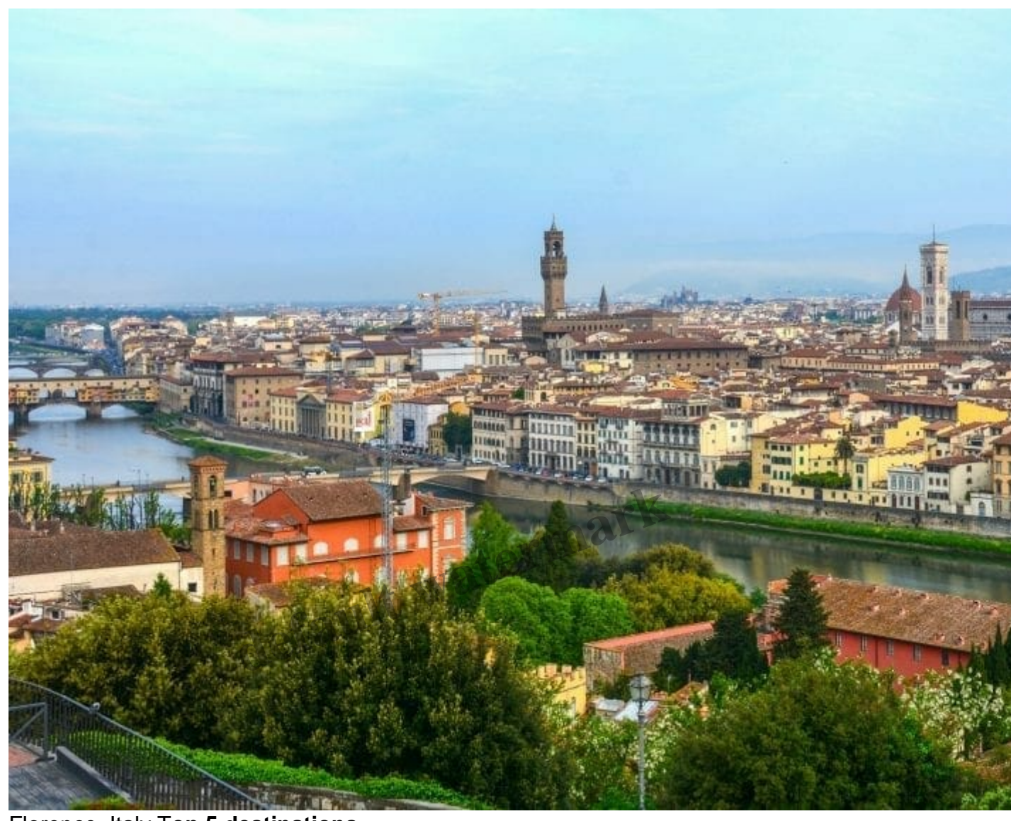
Florence, Italy Top 5 destinations

Check out Italy's official tourism website.