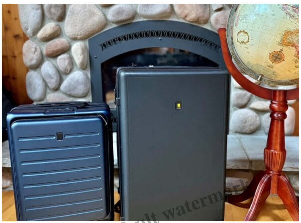
Travel Tips & Resources