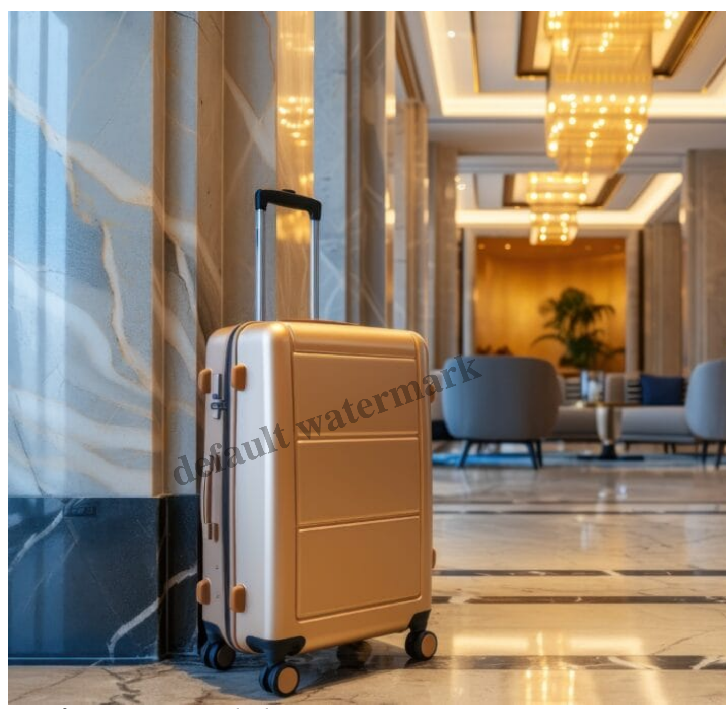
Top 5 destinations

There are many fantastic accommodations in these incredible destinations. Below are two of our favorite booking sites. If you plan to book your travel, use them to find your perfect accommodation.