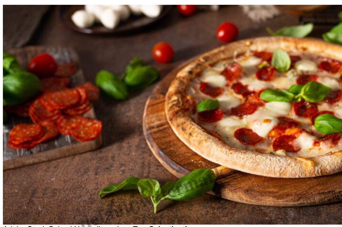
Salami Neapolitan pizza Top 5 destinations

Embark on a visit focused on culinary delights promises an immersive journey through the flavors and traditions that define Italian cuisine. A good starting point is Rome, travelers can indulge in authentic pasta dishes like cacio e pepe and carbonara, paired with local wines in trattorias tucked away in charming alleyways. Continuing to Florence, the tour explores the Tuscan culinary scene, renowned for its hearty ribollita soup, succulent bistecca alla fiorentina, and decadent gelato. In Venice, dining experiences include fresh seafood risotto and cicchetti (local tapas) in lively bacari (wine bars) lining the canals. Heading south to Naples, the birthplace of pizza, travelers can savor traditional Neapolitan pizza Margherita.