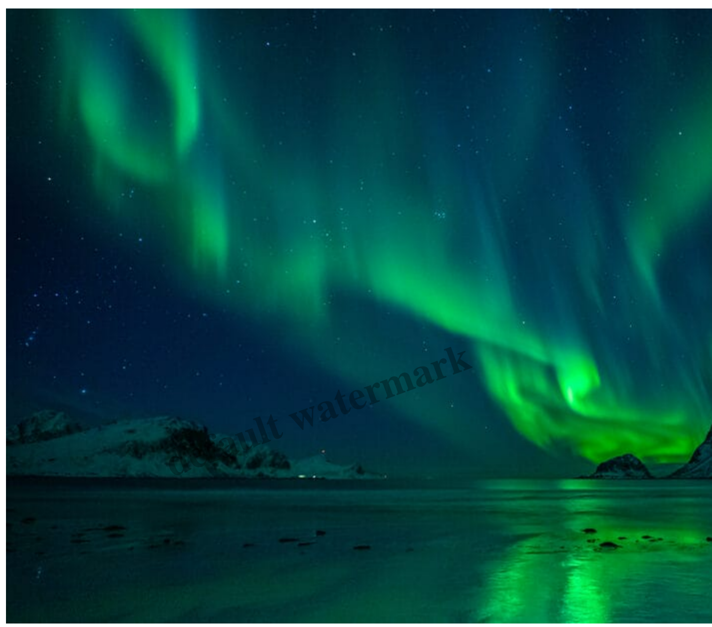
Northern Lights Iceland

In Iceland, the Northern Lights, or Aurora Borealis, paint the night sky with mesmerizing hues of green, purple, and sometimes even red. These celestial displays occur predominantly in the winter months when the nights are longest and darkest, typically from September to March. The natural conditions in Iceland, including its clear skies and minimal light pollution outside of Reykjavik, provide ideal viewing opportunities for this spectacular phenomenon. Visitors often venture away from urban areas to locations like Thingvellir National Park or the Snaefellsnes Peninsula, where they can witness the dancing lights against the backdrop of Iceland's rugged landscapes, creating a truly unforgettable experience in the heart of the Arctic Circle.