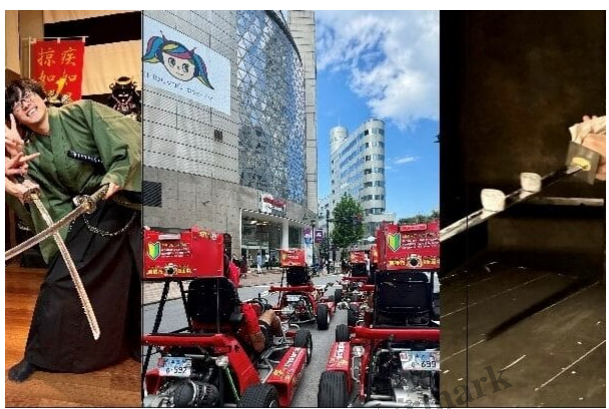
Destinations / Japan