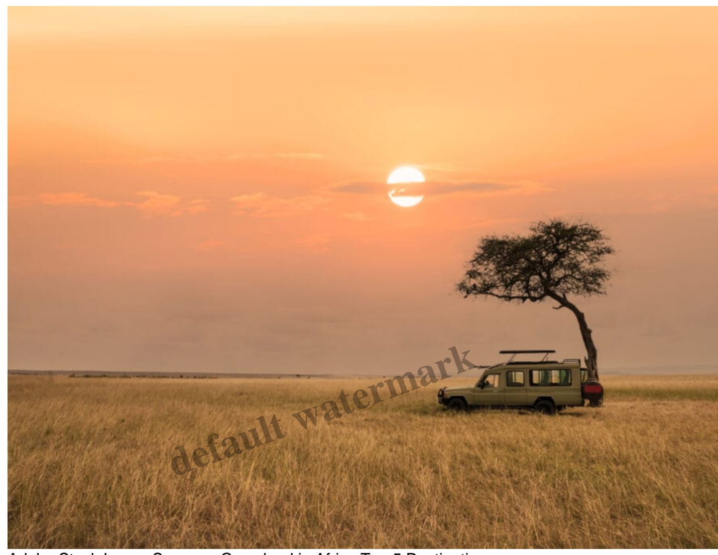
Savanna Grassland in Africa Top 5 Destinations

A safari in Serengeti National Park, Tanzania, is a quintessential African wildlife adventure. Renowned for its vast savannas and diverse ecosystems, the Serengeti is home to the legendary Great Migration, where millions of wildebeest, zebras, and gazelles traverse the plains in search of fresh grazing grounds. Visitors can witness this spectacular natural event, as well as encounter the Big Five—lions, elephants, buffalo, leopards, and rhinos—amidst the park's varied landscapes, from open grasslands to riverine forests. Game drives at dawn and dusk offer the best chances to see predators on the hunt and other wildlife in action. The Serengeti's rich biodiversity, dramatic sunsets, and endless horizons create an unforgettable safari experience, immersing travelers in the raw beauty and vibrant life of the African wilderness.