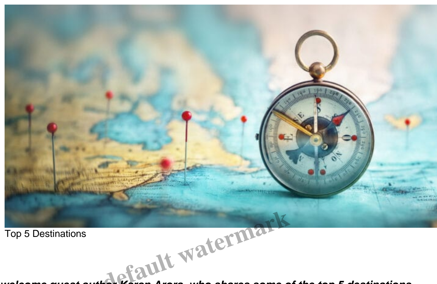
Top 5 Destinations

We welcome guest author Karan Arora, who shares some of the top 5 destinations that should be on your travel list. The world is out there traveling, and it can be overwhelming to determine where to go next. Karan shares these fantastic places to consider. Whether doing it independently as we do or taking a tour, as in the links in the article, the key is GO. We have done both Italy and Iceland on the list, and we can't say enough about both countries. We will be visiting Kyoto, Japan, in September, and the info here will guide us in planning our adventures.