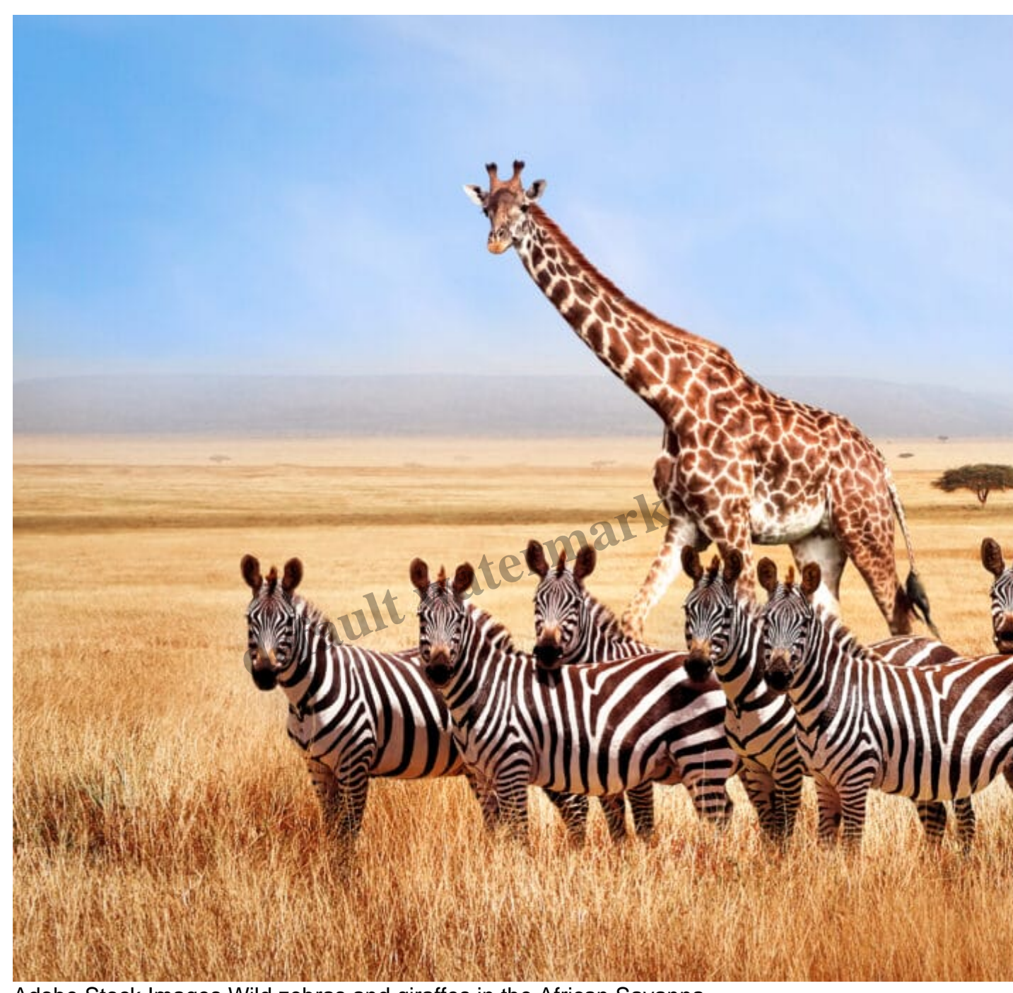
Wild zebras and giraffes in the African Savanna

Check out Tanzania's official tourism website.